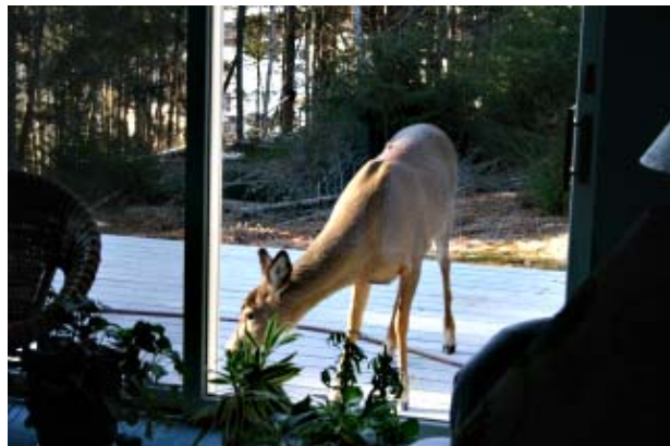
The grass is always greener